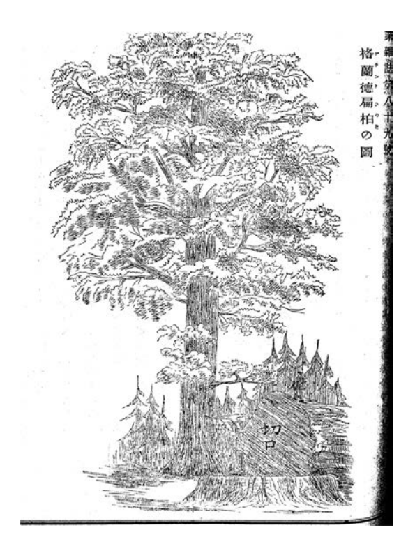
Fig. 11 The Illustration of the " Grant Hinoki " (Tsuda Sen, Nōgyō Zasshi 『農業雑誌』, Gakunōsha, No. 89, September 15, 1879. Tokyo University Meiji Shinbun Zasshi Bunko Collection)

is known as the holiday for planting trees, on which schoolchildren and their teachers plant trees all around Israel. The tree-planting ceremonies symbolize the renewed connection between the nation and its land."<sup>58)</sup>