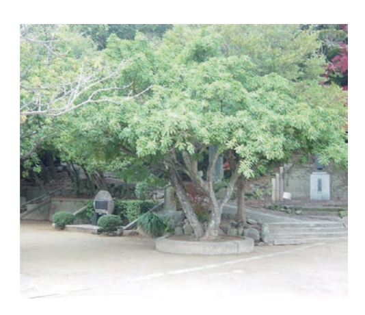
Fig. 2 The Memorial Tree in Nagasaki General Grant's Memorial Tree