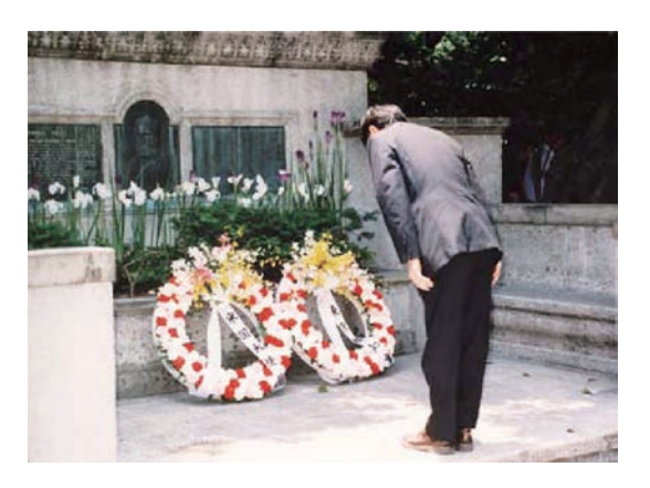
Fig. 13 Wreath-Laying Ceremony in Ueno Park (Photo: May 27, 2005, Taito City, Secretarial and Public Relations Section)