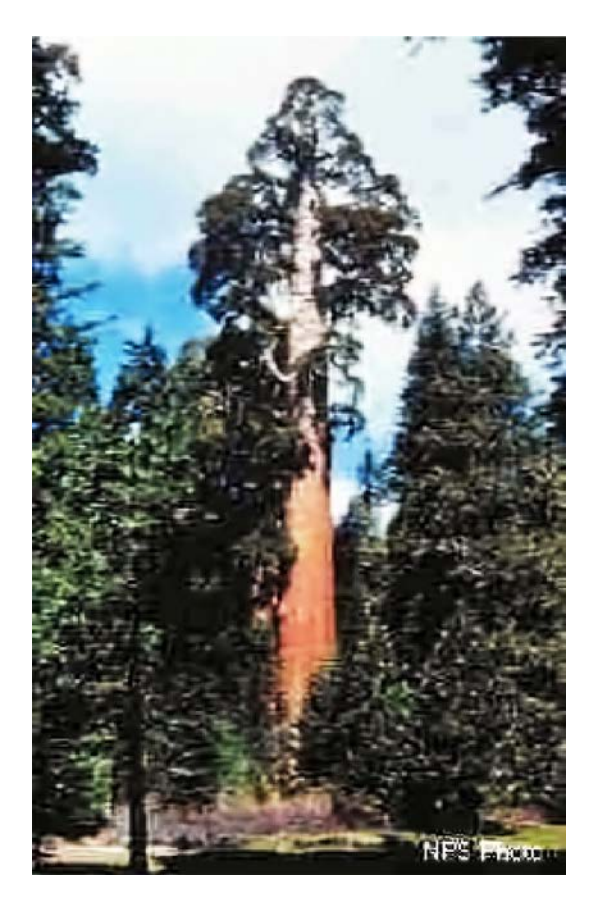
Fig. 8 General Grant's Tree The Nation's Christmas Tree in General Grant National Park: The Grant Grove