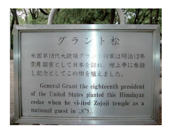
Fig. 6 The Plaque by the Memorial Tree at Zōjōji