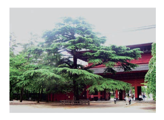
Fig. 4 The Memorial Tree in Shiba, Tokyo General Grant's Memorial Tree