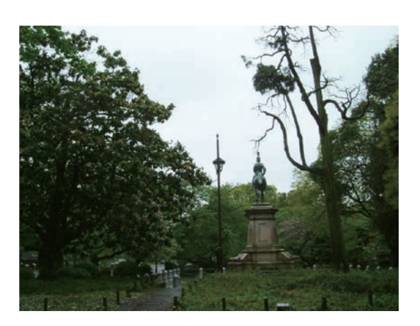
Fig. 7 The Memorial Trees in Ueno, Tokyo Right: Cypress lawsoniana planted by General Grant Left: Magnolia planted by Mrs. Grant