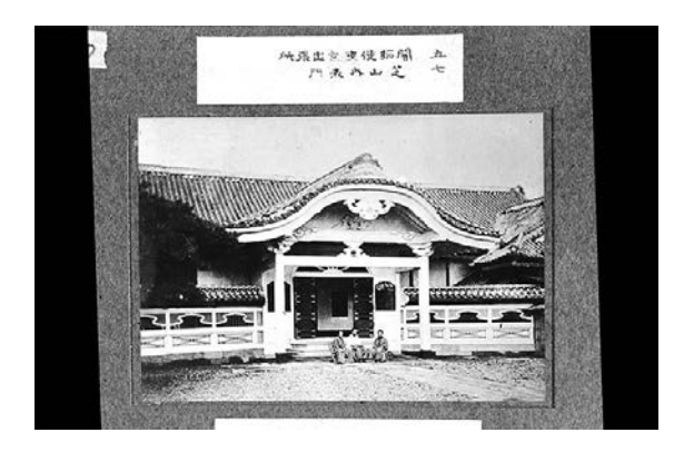
Fig. 5 The National School of the Hokkaido Settlement Board

As is apparent in Fig. 5, the national school Kaitakushi, a precursor of the Sapporo Agricultural College (Sapporo Nōgakkō 札幌農学校), was instituted temporarily in Tokyo in 1872 for persons engaged in the settlement of Hokkaido, since the Sapporo infrastructure was not yet complete. As is well known, the Meiji government had created the Kaitakushi in July 1869 as a part of its national defense strategy against Russia. Why was Zōjōji selected as the site for this school? The reason may be that, prior to opening Japan to foreign trade, Zōjōji made the arrangements for and corresponded with, the American delegations;<sup>21)</sup> and again, at the beginning of the Hokkaido settlement, the Govern-